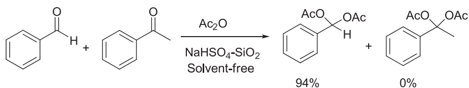
Scheme 2 Chemoselective synthesis acylal from aldehyde.

sodium hydrogen sulphate as a catalyst. Using this catalytic system, the highly selective conversion of an aldehyde in the presence of ketone was observed (Scheme 2).